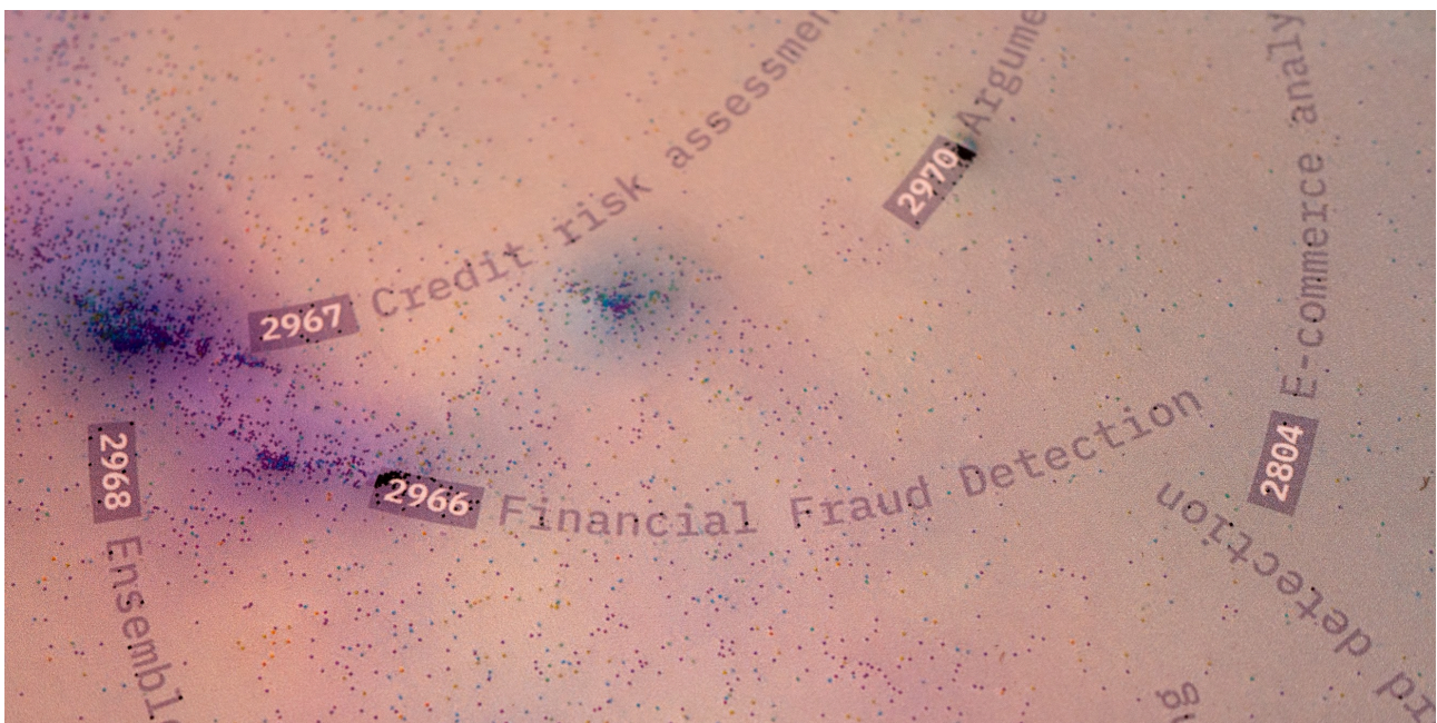
Figure 2. Detail of annotations on the Grounding AI Map.

The annotation process for the Grounding AI Map addresses a critical challenge: the map itself, derived from highly specialised scientific texts, is not immediately relatable or accessible to general audiences. To overcome this, a specific annotation protocol was developed, leveraging artificial intelligence to generate contextual labels that maintain the complexity and richness of the underlying data. Unlike conventional mapping techniques, which often oversimplify information into uniform clusters, this approach strikes a careful balance—it simplifies content sufficiently to support readability without reducing nuanced research insights into generic narratives of technological advancement. Annotations thus serve as points of entry, providing clarity while preserving the map's capacity to provoke exploration and interpretation (figure 2).