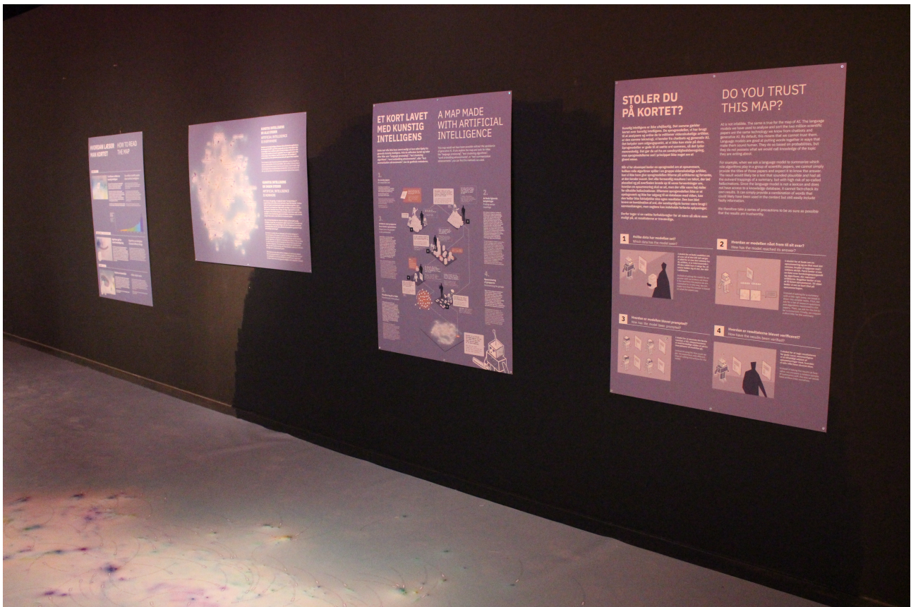
Figure 5. Posters from the exhibition that explain the design and methodology behind the Grounding AI Map.

telephone, letting them discuss specific topics represented in the visualisation. The map, the viewers, the system of wayfinding, and the app compose a mechanism of learning through discussion in a very Freire way to transfer knowledge by engaging with dialogue (Freire [1970] 2000).