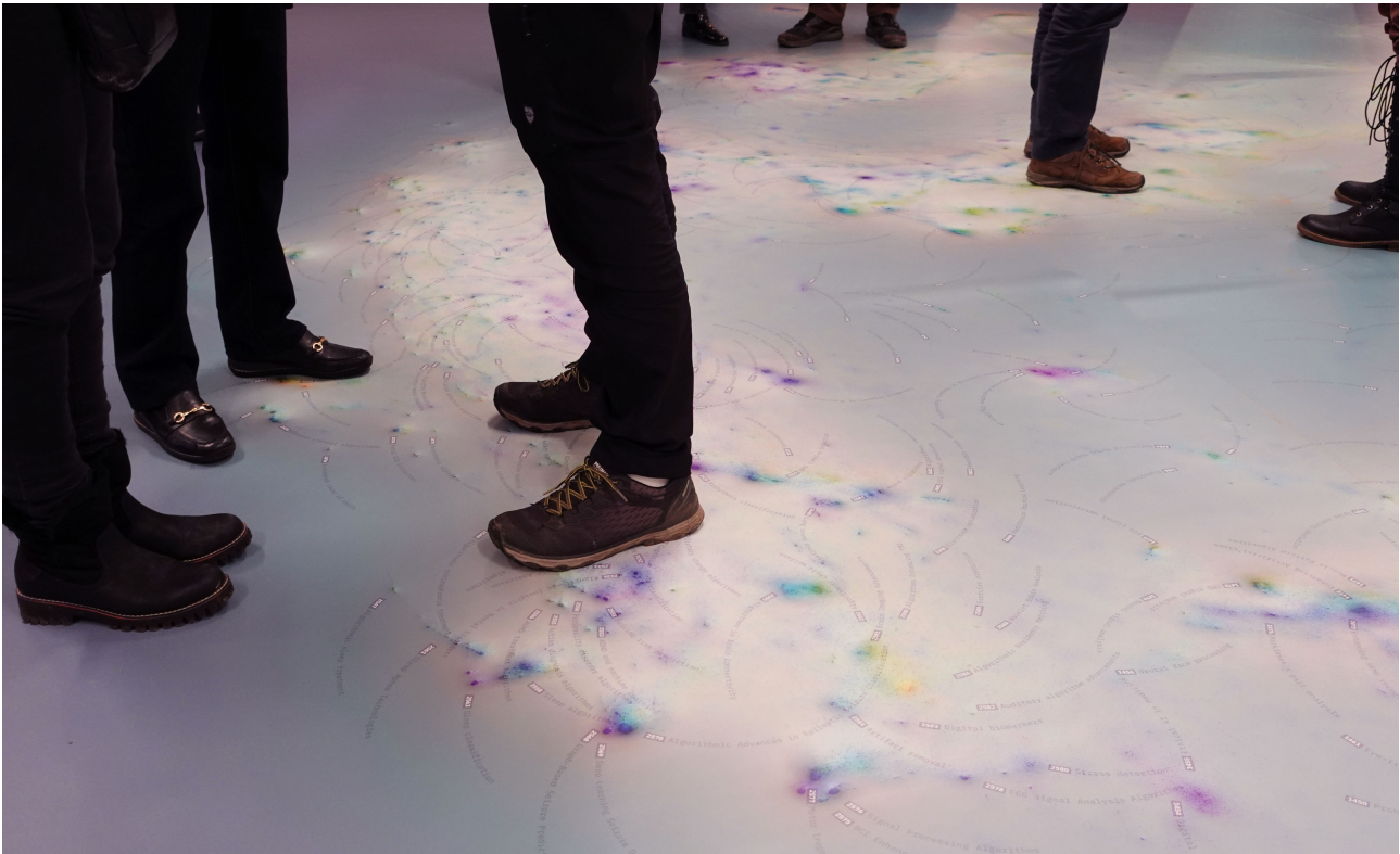
Figure 1. Visitors walking on the Grounding AI Map

format, and transportation. However, transforming the map into a physical, explorable landscape enables the audience to interact with the data directly—walking across it, observing distances, and zooming in or out physically—thus influencing engagement through scale and movement (figure 1).