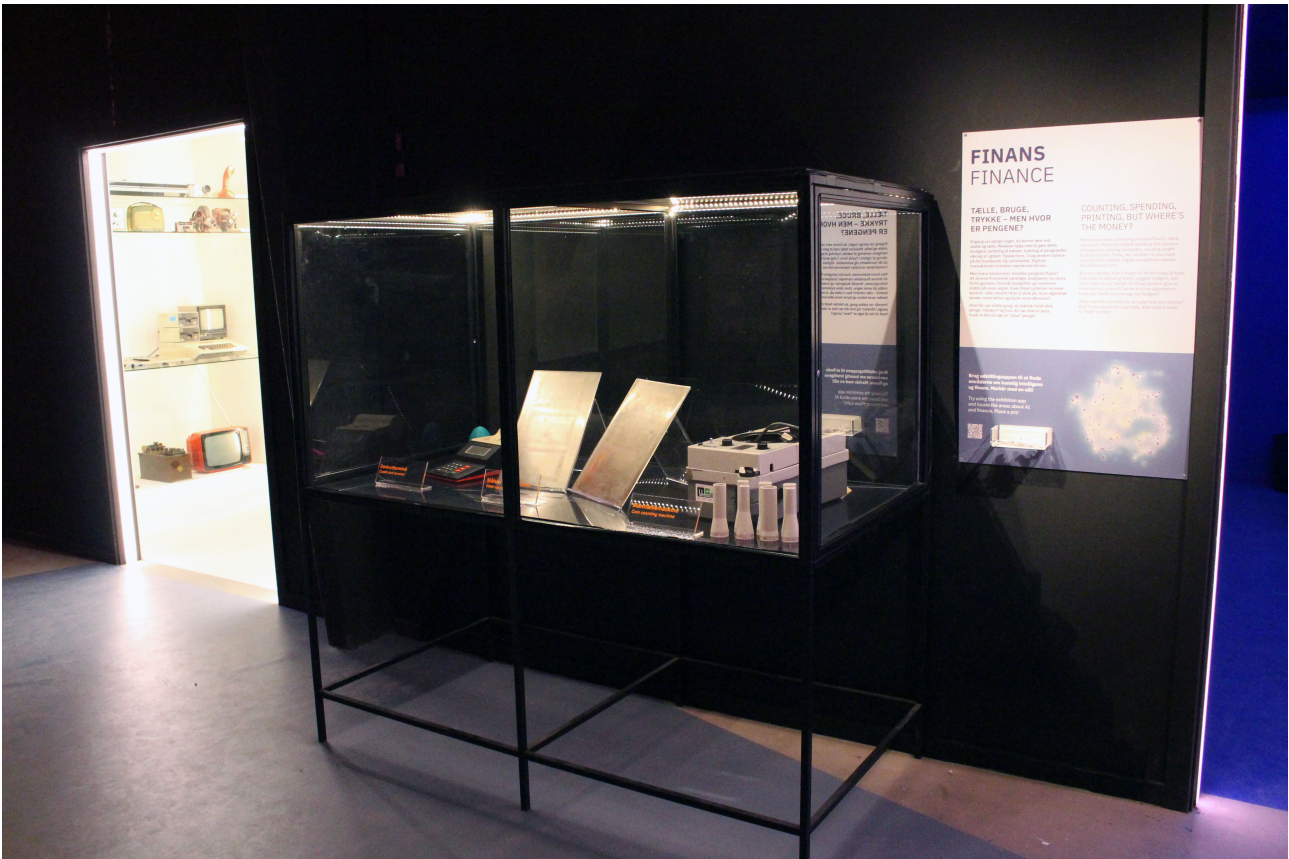
Figure 6. One of the displays placed around the Grounding AI Map, showing artifacts related to finance.